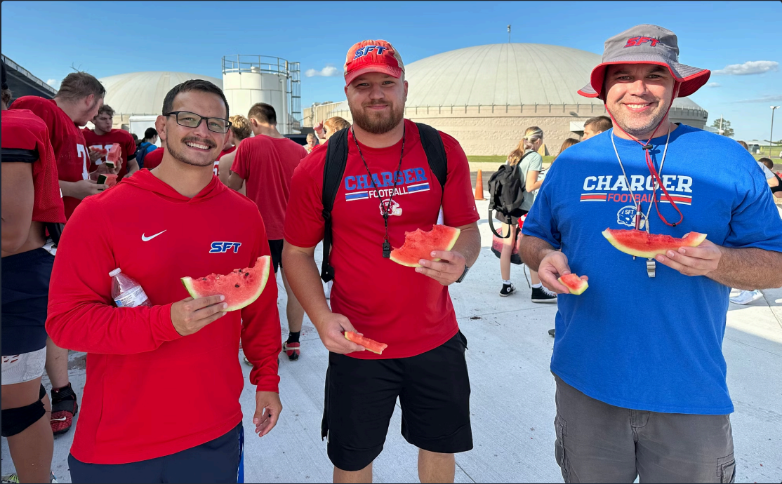
Football players and coaches enjoyed some watermelon after a great practice on Monday, August 25th.