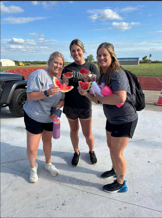
Volleyball players enjoy an invitation from the football team to a watermelon feed following practice on Monday, August 25th.