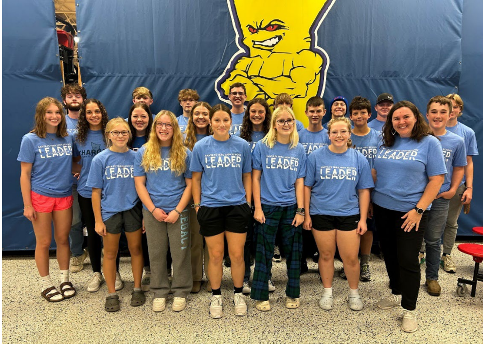
A portion of our FBLA members in our new chapter tshirts.