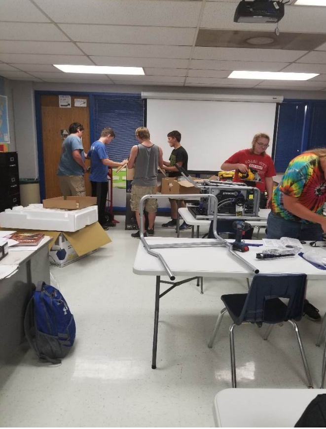
12 x 16 Baseball shed being built by the students putting together new equipment

Last year the industrial education classes were designing tiny homes and learned of a Veteran's Community project in Kansas City. During the month of May, several students went to visit that project. When we came home from the field trip we were excited to start our very own plans of building tiny homes for the veterans and others. The veteran's project in KC hit some infrastructure road blocks. We would still like to do something for the veterans even though the project in KC had issues.