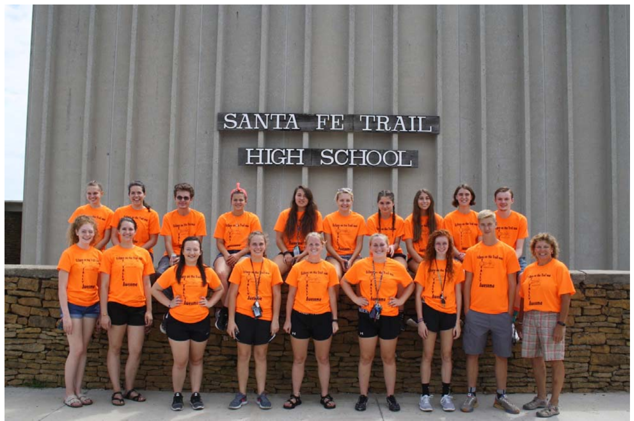
2017-18 NHS Members and Adviser (2 members are missing in the photo)