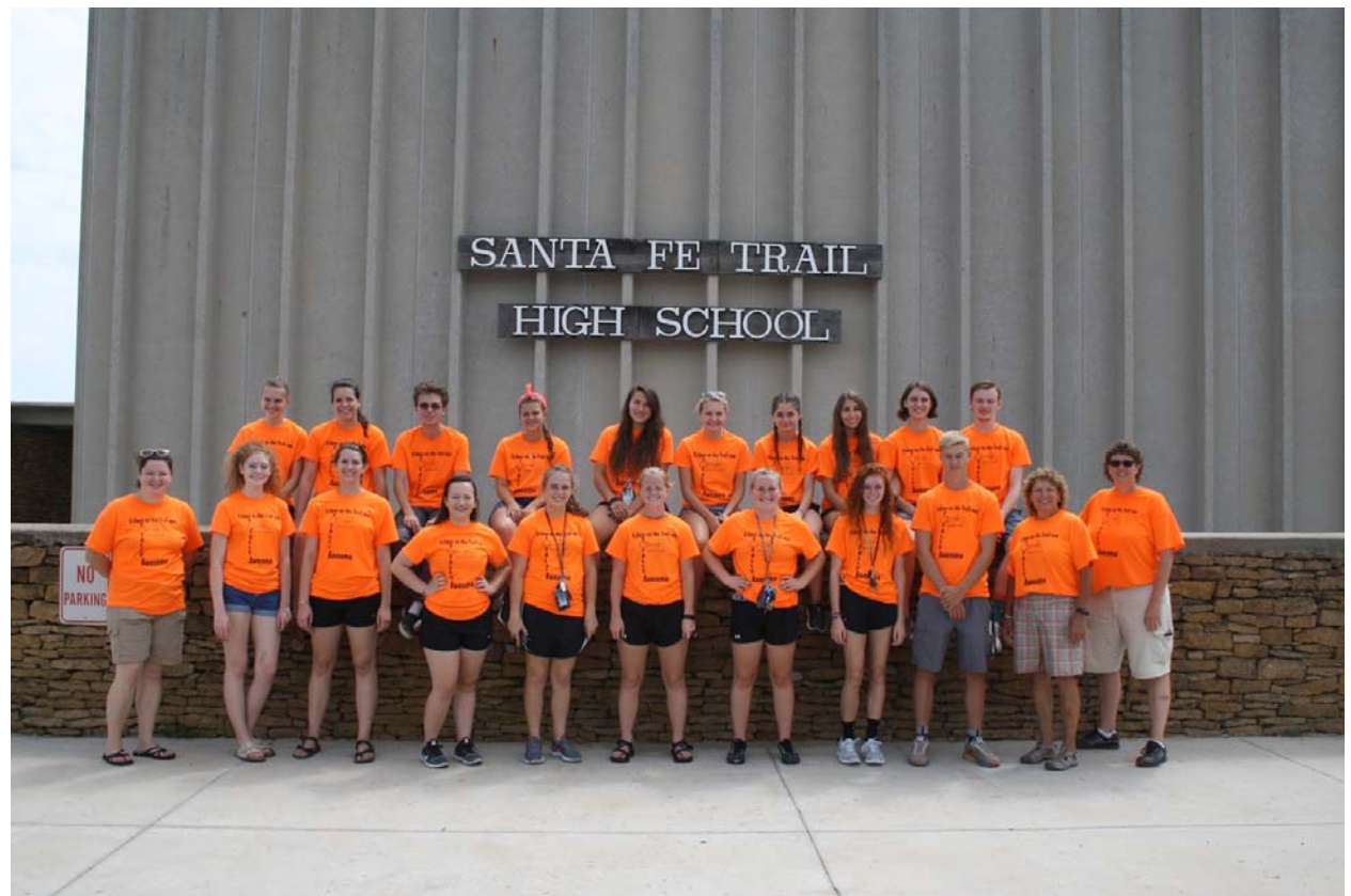
Solar Eclipse Event - NHS Members & Staff Volunteers (missing 2 NHS members & 4 staff volunteers)