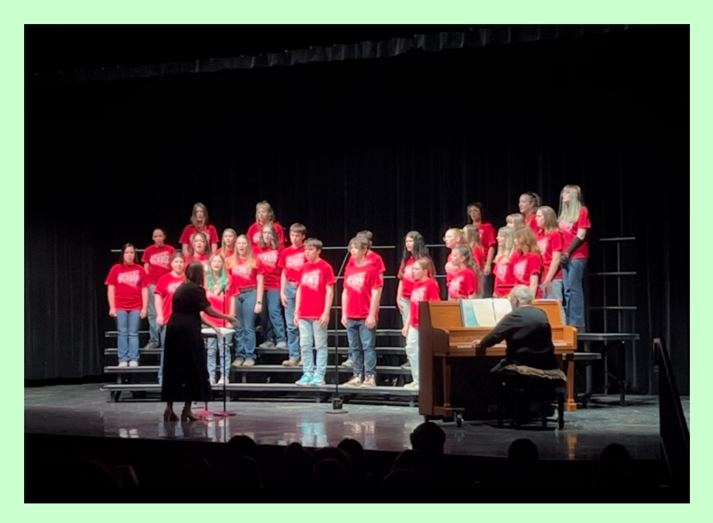
JH Choir at their Combined Concert at SFTHS on March 6th.

• 6th Grade/JH Choir Combined Concert - April 30th @ 7pm