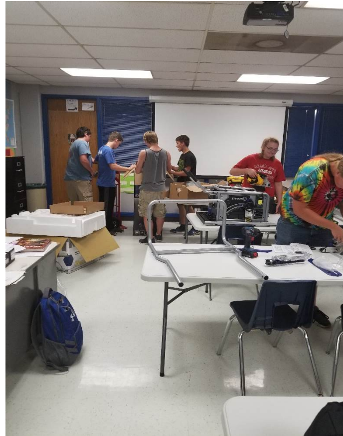
12 x 16 Baseball shed being built by the students putting together new equipment

Last year the industrial education classes were designing tiny homes and learned of a Veteran's Community project in Kansas City. During the month of May, several students went to visit that project. When we came home from the field trip we were excited to start our very own plans of building tiny homes for the veterans and others. The veteran's project in KC hit some infrastructure road blocks. We would still like to do something for the veterans even though the project in KC had issues.