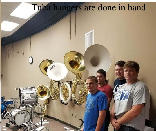
Tuba hangers are done in band room