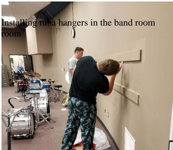
Installing tuba hangers in the band room

Other projects we are currently working include: